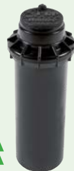
Hunter Sprinkler PGP Gear Driven 50° to 360° HUNPGP-04-ULTRA