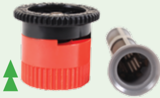
Hunter Sprayer Nozzle Pro Adjust 360° HUN10-A