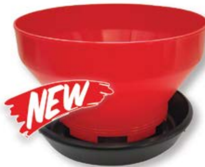
NEW BULK CHICK FEEDER

See our wide range of products at www.poltek.co.za