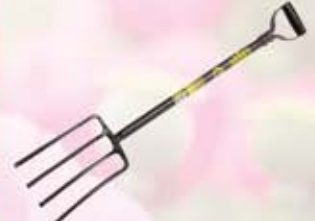
4 Prong Digging Fork