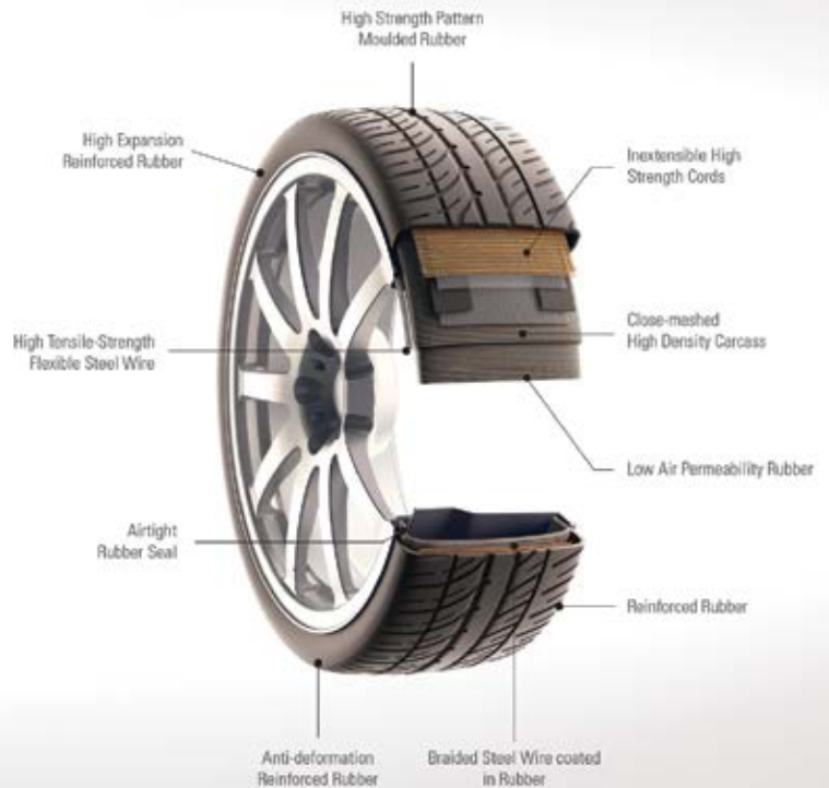
FIG. ONE TOWN INDUSTRIES