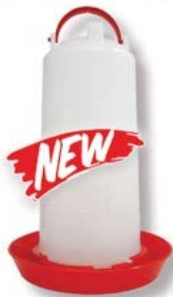
NEW 4L WATER FOUNT WITH HANDLE