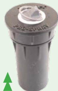
Hunter Spray Head Pro Pop Up 5cm HUNPROS-02