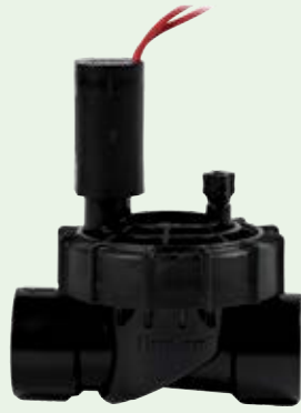
Hunter Valve Glove PGV Jar Top 25 mm HUNPGV-100-JTG-B