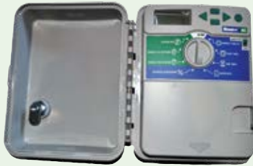
Hunter Outdoor XC Controller HUNXC-601-E