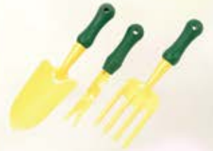
3 Piece Garden Set