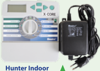
Hunter Indoor XC Controller HUNXC-601I-E