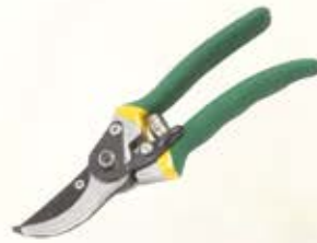
Medium Duty Secateurs

Spring is the time of plans and projects