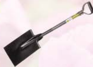
No. 2 Digging Spade