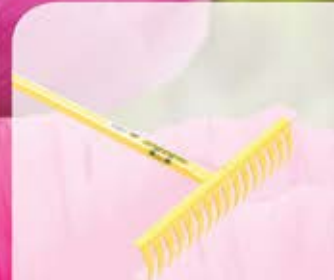
Deluxe Garden Rake